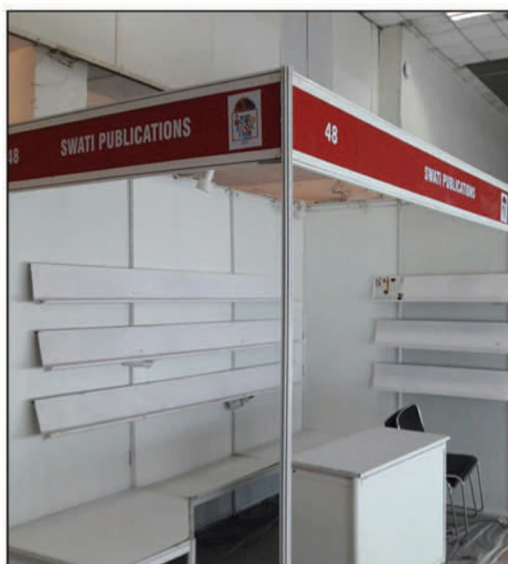
STALL 3X2 MTS